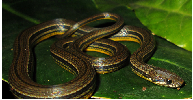
Figura 3. Rhadinella godmani de Fraijanes, Alajuela, Costa Rica.

The Yellow-bellied Litter snake, Rhadinella godmani (Fig. 3) is distributed from Oaxaca and Chiapas in Mexico to the western of Panama from 1200 to 2650 m (Kholer, 2008). This is an uncommon small brown to salmon striped snake with yellow venter that has been observed active during the day under logs and surface debris in forests or pastures (Savage, 2002; Loza et al., 2017). On 23 February 2020, at 19:00 h I observed an adult of R. godmani moving among the leaf litter accumulated on the edges of a small stream tributary of the Tambor river in a forest