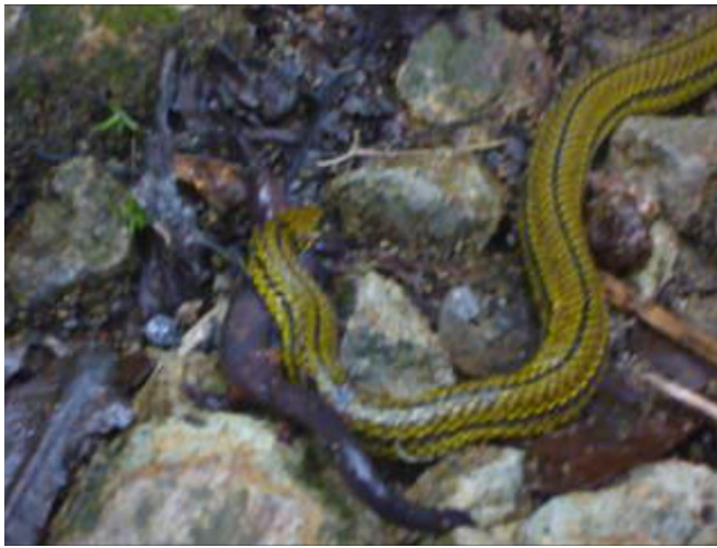
Figura 2. Rhadinaea calligaster depredando una salamandra púrpura, posiblemente Bolitoglossa pesrubra . Imágen tomada de video.

cm total size) coiling around and biting a purple salamander (ca 10 cm total size) along a forested trail at km 9 (Barbas de Viejo) on the Cerro Chirripó way at Chirripó National Park, Limón Province, Costa Rica (elev. 2900 m). The salamander belongs to the genus Bolitoglossa , and was probably B. pesrubra according to its distribution and purple coloration (Eduardo Boza, com.pers.). The observation was videorecorded and can be watched at ( https://www.youtube.com/watch?v=-MQeRqLaiNM&feature=youtu.be ). The snake was stretched and held the salamander at the back of the head. The salamander tried to move at the beginning of the observation, but after a couple of minutes stopped moving (Fig. 2). After 10 minutes, the snake began to eat it through the top of the head, but FSV did not witness the complete swallowing process, but based on the immobility of the salamander we assume the snake completed the task.