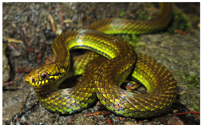
Figura 1. Rhadinaea calligaster del Parque Nacional Braulio Carrillo, Heredia, Costa Rica.

2002; Kholer, 2008). This is a small green and black snake, relatively common and found under the logs and surface debris in pastures and other disturbed areas or in primary forest of humid forests or crossing roads in forested areas (Savage, 2002; Solórzano, 2004). On 8 August 2015, at 1145 h, Felipe Saprissa Vargas (FSV) encountered an adult R. calligaster (aprox.50