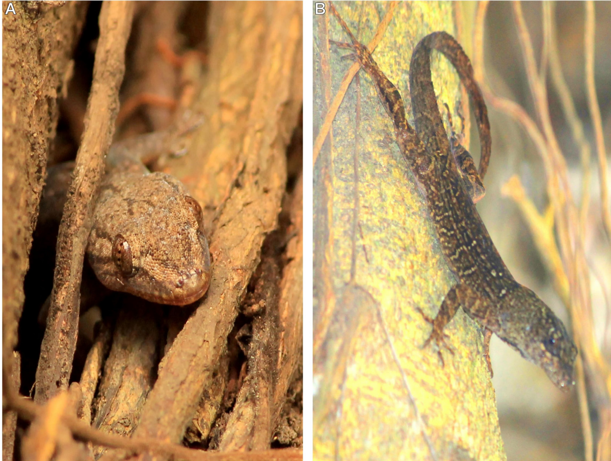
Figura 3. (A) Un individuo de Hemidactylus frenatus ; (B) Un espécimen observado de Norops sagrei en los árboles adyacentes habitados por las otras dos lagartijas. Figure 3. (A) An individual of Hemidactylus frenatus ; (B) An individual of Norops sagrei in trees adjacent to those inhabited by the other two lizards.

snout-vent length of 60 mm for Honduran specimens) and N. sagrei (maximum snout-vent length of 70 mm for Honduran specimens) (Cole et al., 2005; McCranie & Köhler, 2015; McCranie, 2018). Hemidactylus frenatus is also a possible predator of G. albogularis since it attacks, predated, and consumes the eggs of other lizards, causing interspecific predation (Cole et al., 2005; Díaz Pérez et al., 2012; Gardner & Jasper, 2012), as in the case of G. albogularis , where attacks by H. frenatus have been evidenced (Alemán & Sunyer, 2015) and in the case of N. sagrei , which is known for its cannibalistic behavior and for predated other lizards (Campbell & Gerber, 1996; Gerber, 1999; Lee, 2000; Nicholson et al., 2000; Norval, 2007; Norval et al., 2010). Batista et al. (2019) mentioned the capacity that this anole might have in displacing G. albogularis (Williams, 1969; Schoener et al., 2017). We discuss these behaviors as might be very similar to those mentioned by Pianka (1973) and Fisher et al. (2019) that lead to competition between invasive and native species.