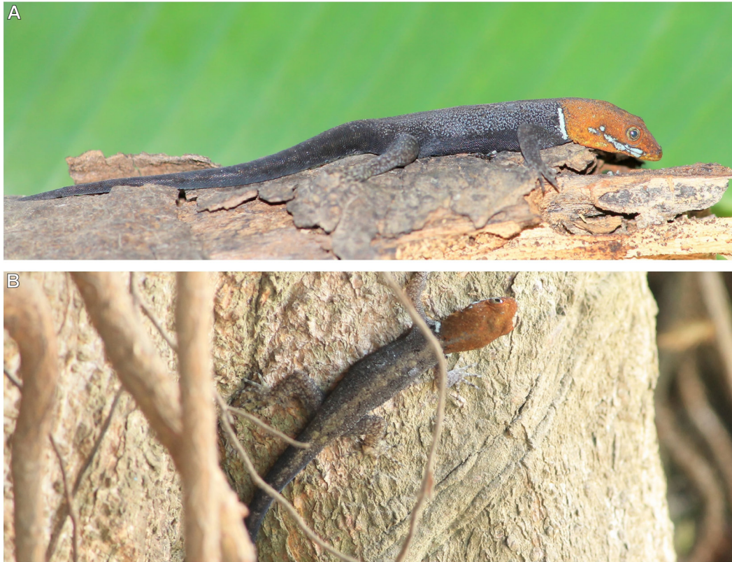
Figura 1. (A) Gonatodes albogularis UVS-V 1242 fotografiado luego de su captura; (B) Fotografía in situ de G. albogularis UVS-V 1242. Figure 1. (A) Gonatodes albogularis UVS-V 1242 photographed after capture; (B) In situ photo of G. albogularis UVS-V 1242.

Sula, Departamento de Cortés, Honduras (UVS-V 1242, field tag EPA 01). The specimen measured a total length of 84.6 mm, snout-vent length of 36.1 mm, and a tail length of 48.5 mm. Based on the two visits made, we suggest that there is an established population of G. albogularis , due to the presence of three adult males and two juvenile females. Our observations were made at the westernmost locality on the Atlantic versant of Honduras, and constitute the first vouchered record for the department of Atlántida.