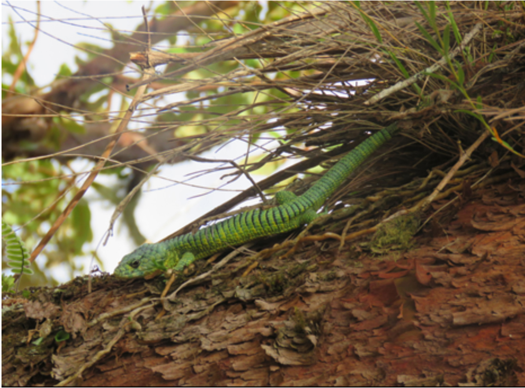
Figura 4. Abronia fuscolabialis descansando sobre una bromelia en La Aplanada (MZfZ-IMG-355).