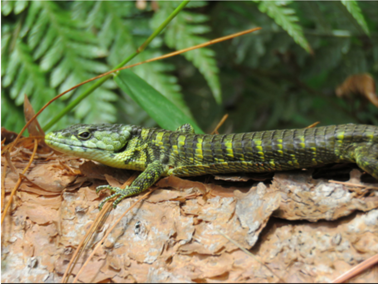
Figura 2. Abronia fuscolabialis descansando sobre un pino caído en Llano Verde (MZFZ-IMG-353).