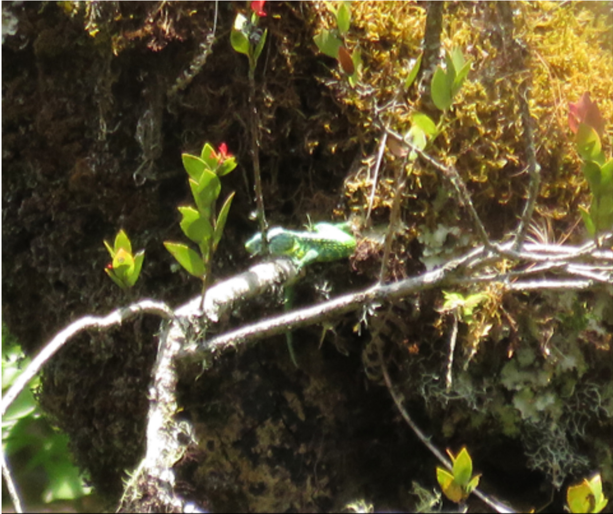
Figura 5. Abronia fuscolabialis asoleándose en una rama en la punta de un Q. laurina en El Embudo (MZFZ-IMG-356).