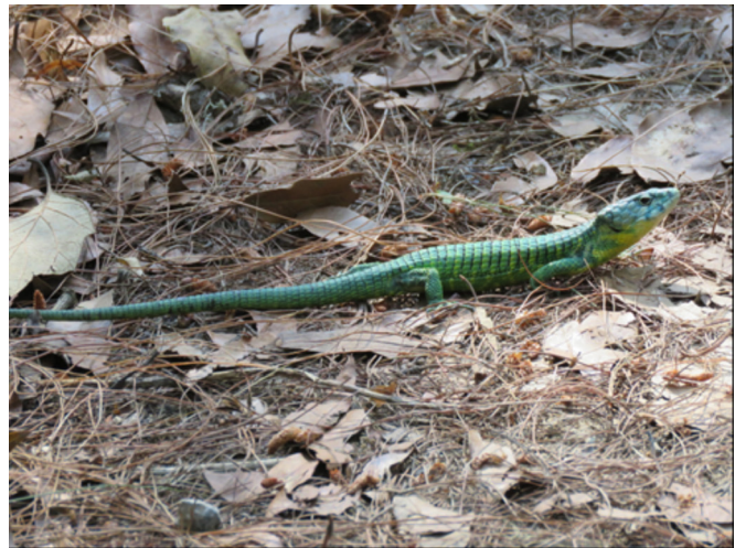
Figura 3. Abronia fuscolabialis desplazándose por el suelo en Arroyo Cuache (MZFZ-IMG-354).