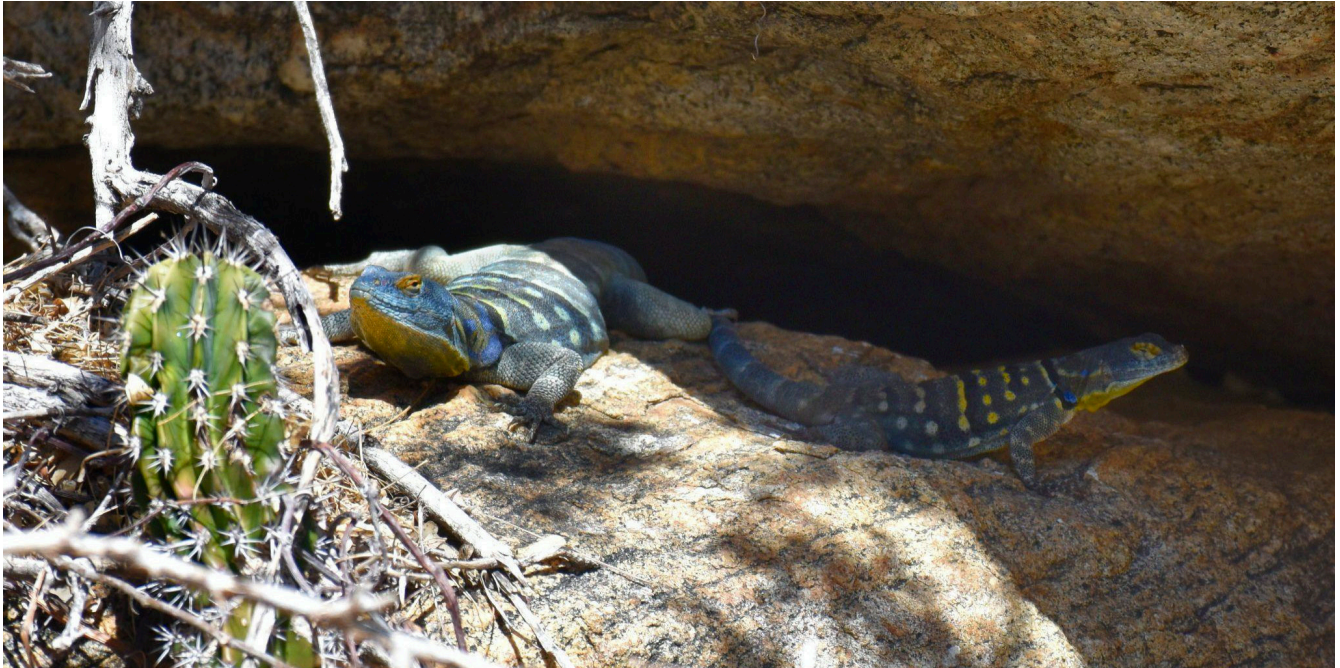
Figure 3 (up). Dos ejemplares de Petrosaurus thalassinus en tolerancia mutua en una grieta.