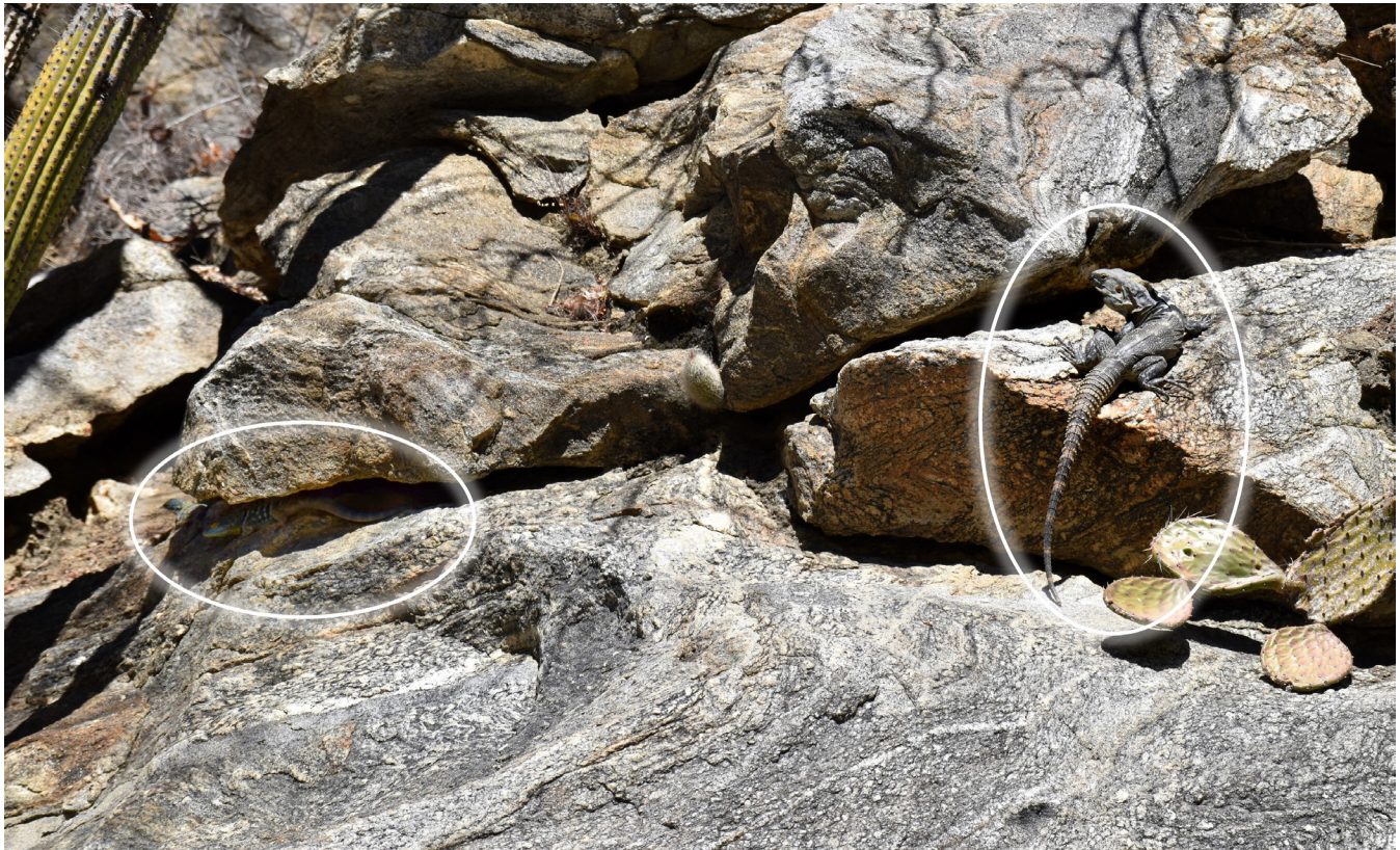
Figura 6. Petrosaurus thalassinus (izquierda) en una grieta (i.e., evitando), en respuesta a la presencia de un Ctenosaura hemilopha (derecha).