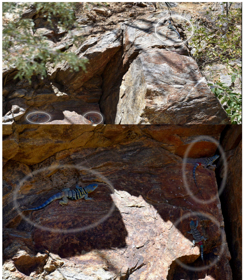
Figura 4 (derecha). Sequence of the interaction between two marked females and a larger unmarked individual of Petrosaurus thalassinus . a) an unmarked individual in survey posture, perched higher on a rock compared to two marked females located lower on the rock. b) the unmarked individual ran down and stayed in close proximity to the two marked females.