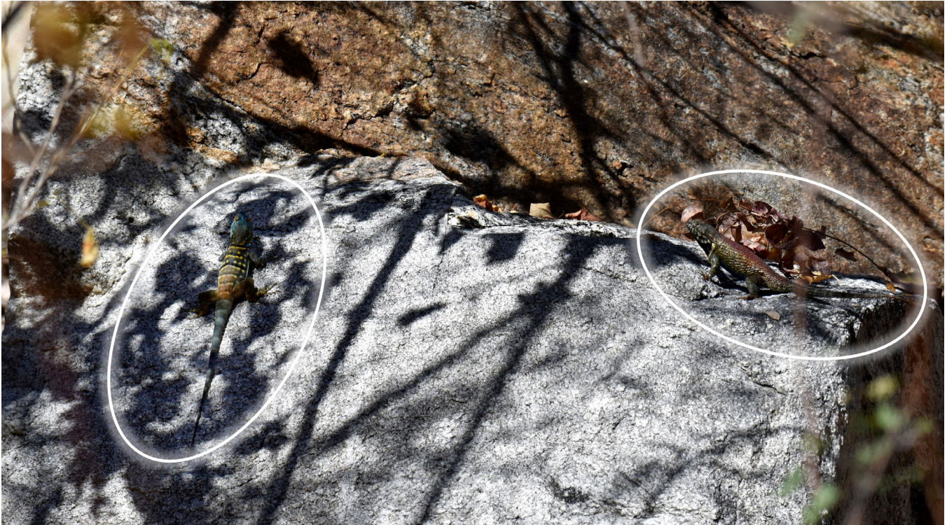
Figura 7. Interacción interespecífica (tolerancia mutua) entre Petrosaurus thalassinus (izquierda) y Sceloporus hunsakeri (derecha).