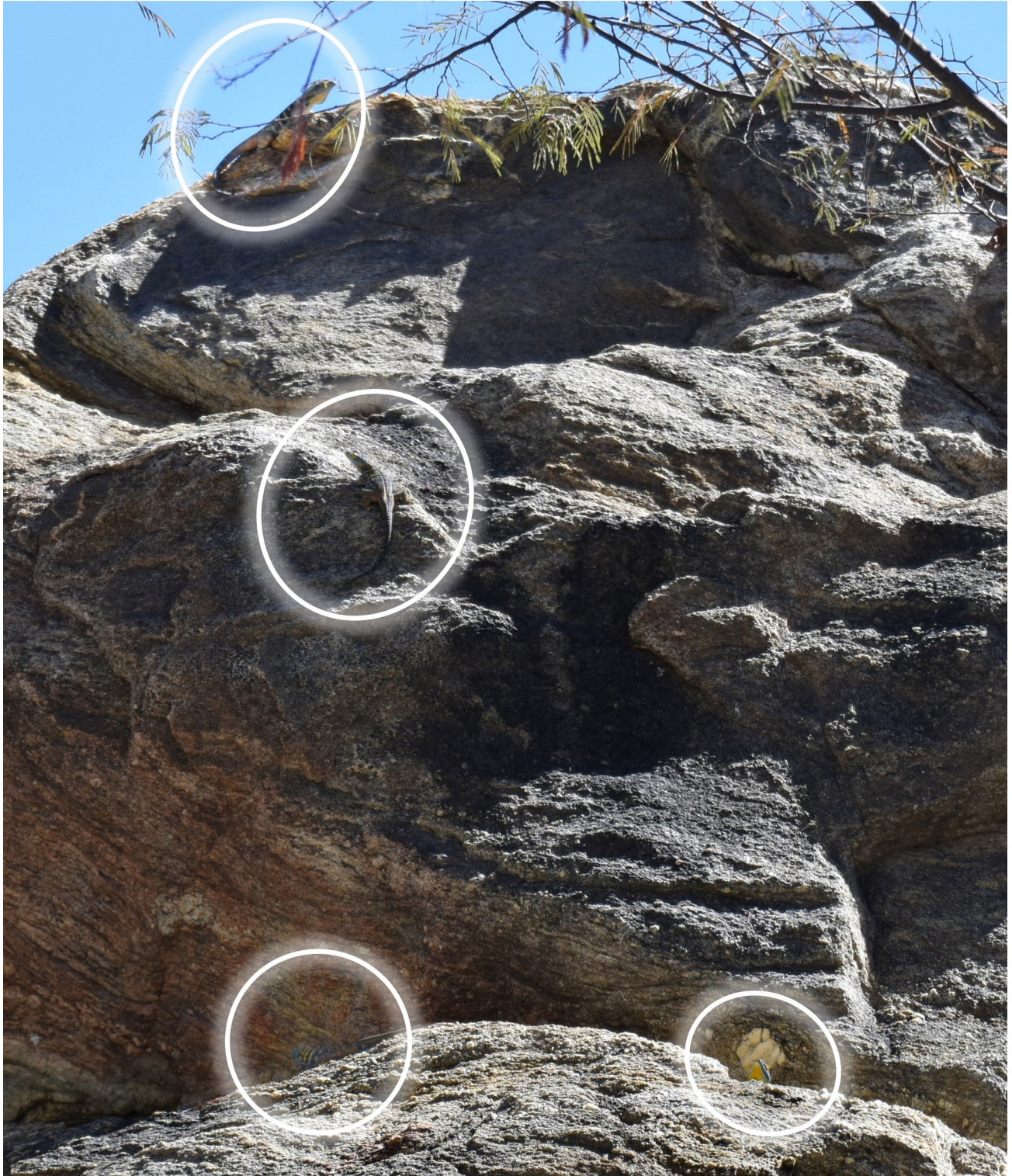
Figura 5. Área rocosa donde se observaron cinco Petrosaurus thalassinus próximos, cuatro de los cuales se muestran en la foto. La agrupación no se identificó durante las observaciones focales y los individuos no cumplieron con nuestra distancia de interacción, por lo que el grupo no se incluyó en los análisis.